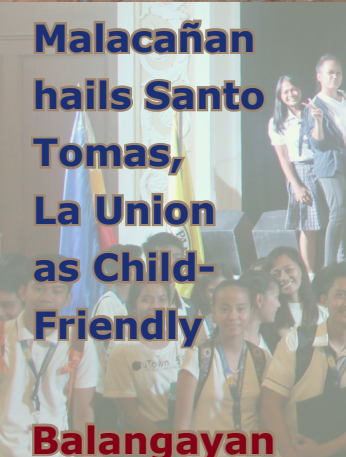
Malacañan hails Santo Tomas, La Union as Child- Friendly