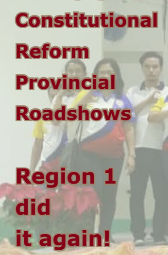
Constitutional Reform Provincial Roadshows